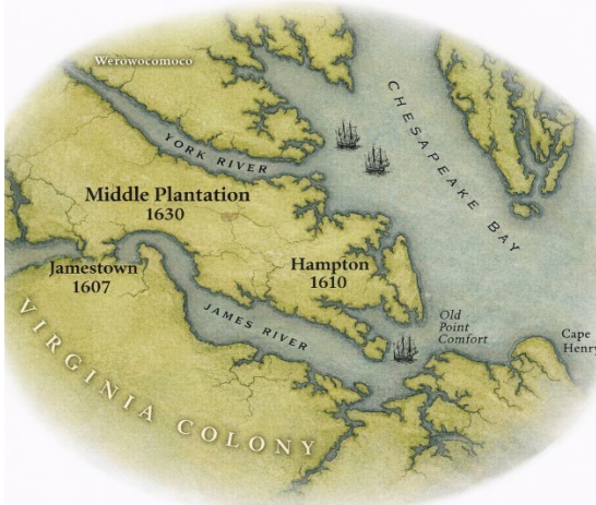
Map of early English settlements along the James River in Colonial Virginia in early 1600s

Powhatan Indians, led by Chief Opechancanough, made a surprise